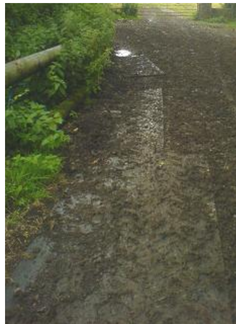
Fig 6: Quarry belting can be a portable solution

(5) Crossing a stretch of "chippings" track - old carpet or quarry belting can be used. (Fig6)