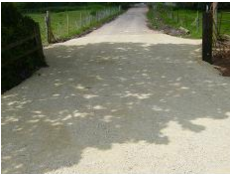
Fig 5: Oolitic limestone is a durable soft stone, that compacts well and offers excellent cow grip. Unsuitable for heavy vehicle use or high rainfall areas.

Heavy roller compaction (70 tonne roller) will help the track bind and shed water, thereby resisting erosion. This will ensure the track lasts longer. It will also reduce the unevenness that results in pooling and protrusion of stones that damage claws.