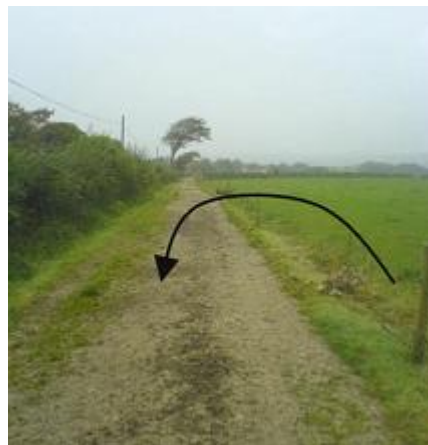
Fig 3: The 'up-and-over' involves digging up subsoil from next to the intended track, moving it over and onto the new track and back filling the topsoil

If new cow tracks are being constructed then it is worth locating a 'free' source of rubble from a building firm. Alternatively the subsoil may be suitable, allowing the 'up-and-over' approach or a farm quarry can be used. (fig 3) The track should run the shortest route (A-to-B) to save materials