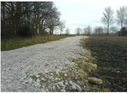
Fig 4: Investing effort in preparing a raised base will improve drainage. Some 'sinking' should be anticipated and an 'over-camber' is rarely the main concern.