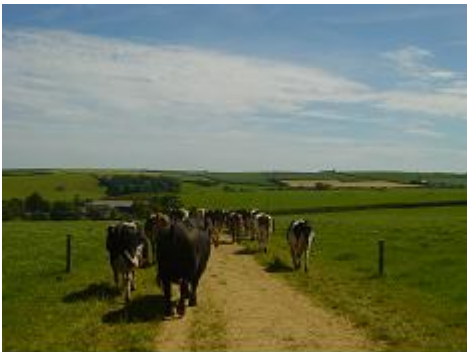
Fig 1: Most large herds using pasture grazing will need cow tracks.

Whilst the best walking surface for cows is probably pasture, pasture will not withstand persistent use by groups of milking cows, especially in wet weather. Therefore, most large herds using pasture grazing will need cow tracks. A good cow track does not need to be expensive. This bulletin reviews some of the cost effective options for cow track construction, as well as ways to herd cows to minimise general lameness.