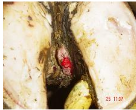
Fig 3b: Infected interdigital growth.

If digital dermatitis is affecting front feet, then this can cause more severe lameness and would indicate exposure to deep slurry somewhere on the farm.