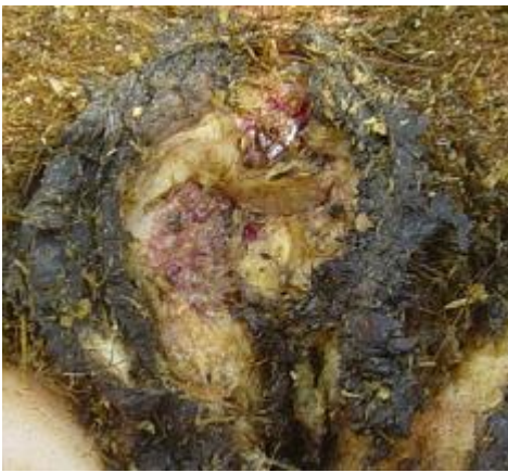
Fig 2e: Mixed lesions which can contain any combination of lesion types above.