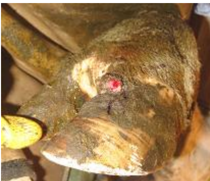
Fig 3a: Coronary band infection..

*Impact comparisons are generally made between cows individually treated for digital dermatitis and those that haven't received treatment. Many infected cows will fall within the untreated group as most are treated in the footbath or eventually recover without treatment. Therefore, these costs are likely to be an underestimate.