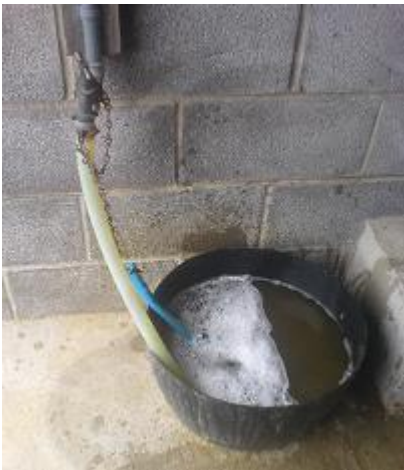
Fig 4: Provide disinfection facilities.

The majority of digital dermatitis lesions respond very well to a combination of: