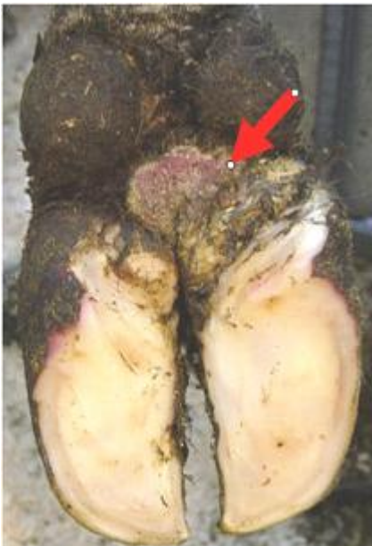
Fig 1: Heel lesion.

Bovine digital dermatitis is an infectious condition of the foot cause by bacteria called Treponemes . It was first reported in Italy in 1974. Since its appearance in the UK in 1987 it has spread widely and is thought to affect at least 70% of UK herds. Within infected herds approximately 41% (0-67%) of cattle have lesions although generally only a small proportion of these (2.8 cases per 100 cows per year, range 0-69.5) are individually treated in most herds. Lesions can have a highly variable appearance (Figure 2a-e below) and can be found at a range of sites including the classic site on the skin around the heel (Figure 1 right), under the heel horn, on the coronary band, on the skin between the claws, under the dew claws, on the pastern skin and on the udder skin.