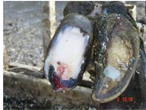
Fig 3c: Toe infection.

If digital dermatitis is affecting front feet, then this can cause more severe lameness and would indicate exposure to deep slurry somewhere on the farm.