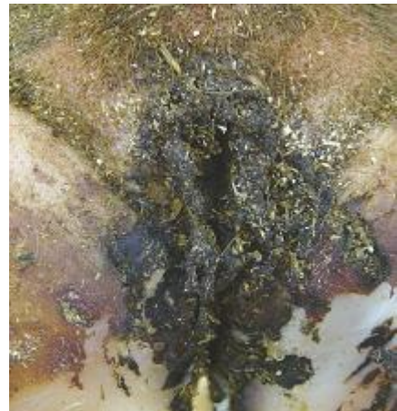
Fig 2c: The dark, crusty appearance of a healing lesion which is not painful.