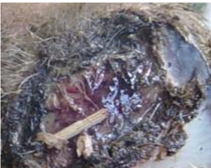
Fig 2a: An erosive lesion, with watery discharge. These are often very painful and frequently bleed on cleaning.