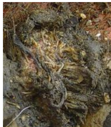
Fig 2d: The fronds of a 'hairy wart' which are painful.